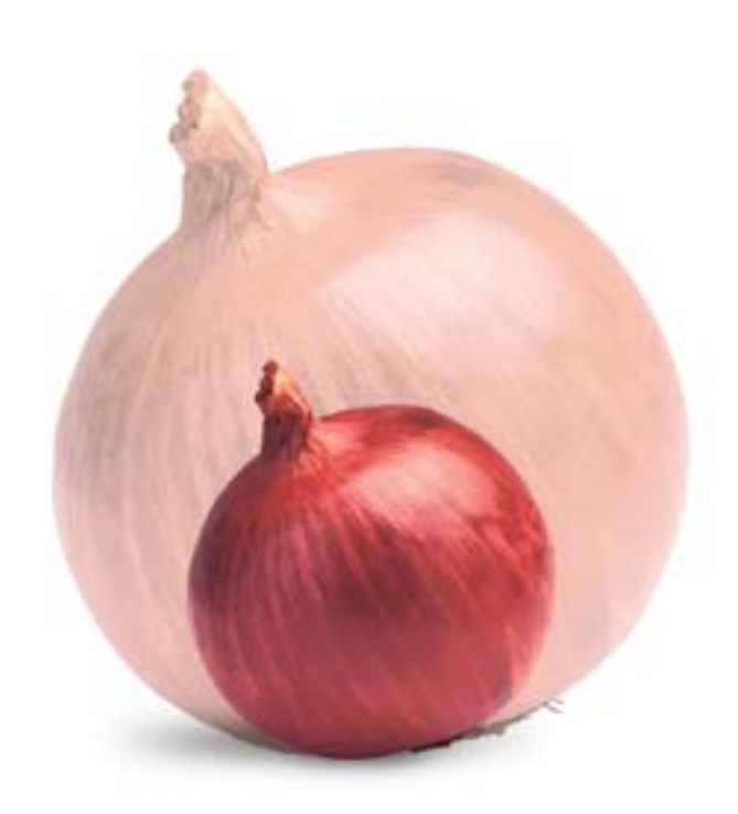
PRE PACK RED DIAMETER SIZE (4.45 CM TO 6.99 CM) 1 3/4" TO 23/4"